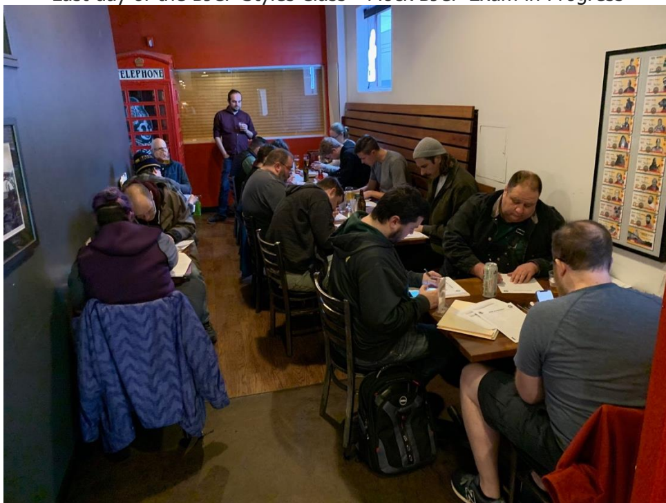
2019 OBC BJCP Styles Class at Rogue Eastside Pub & Pilot Brewery